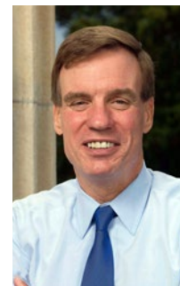
Mark Warner (D-VA)

Sens. Steve Daines (MT-R), John Cornyn (R-TX), and Amy Klobuchar (D-MN)