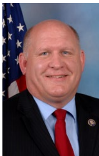
Rep. GT Thompson (R-PA)